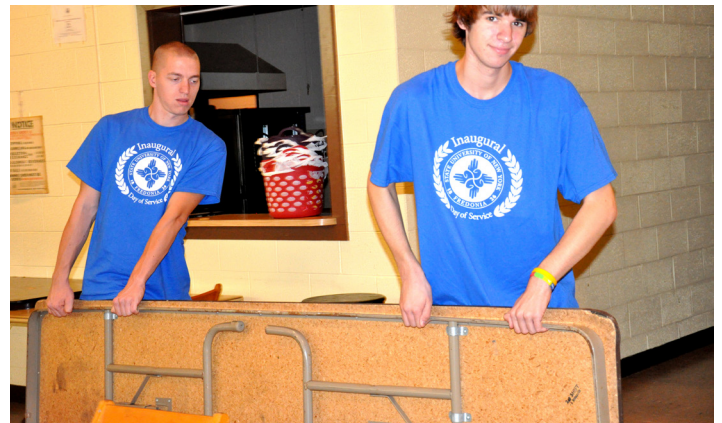
Catholic Student Union members at work.