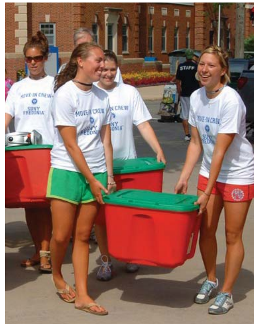
Move-in crew 2008: helping hands.