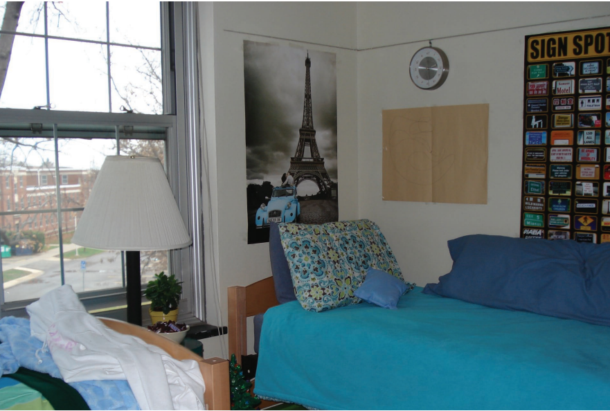
Alumni Hall received new bedroom furniture.