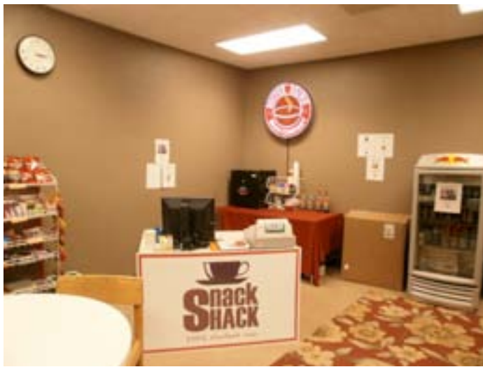
The Business Club's Snack Shack on the third floor of Thompson Hall, and is a fund-raising segment of Business Club