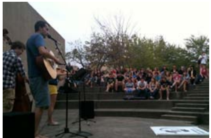
Students gather to hear performances at an Open Mic Night