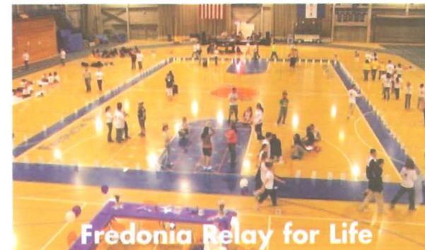
Fredonia Relay for Life