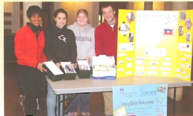
The Shoebox Project Helping Families in Need

R Responsibility: The agency needs to know when they will be able to count on you to help. It is important to have good communication with both the volunteer agency and the volunteer program. All activities and responsibilities outlined in the contract between the agency and the volunteer must be followed.