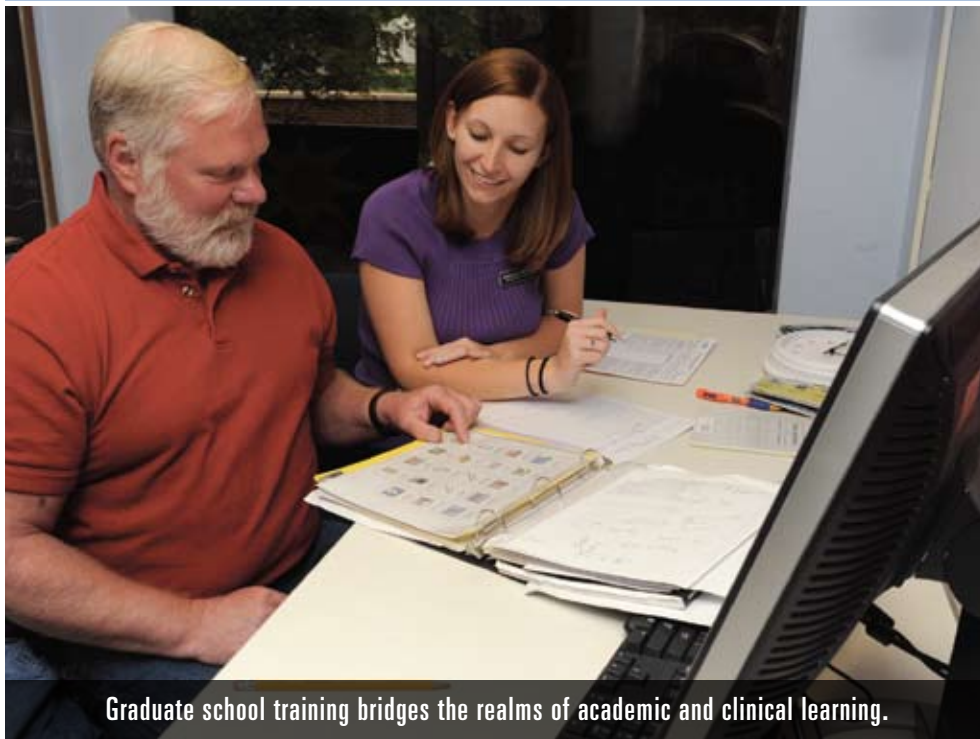
Graduate school training bridges the realms of academic and clinical learning.

Speech-language pathologists (SLPs) make a difference in the lives of individuals who are unable to communicate. Perhaps you know a family member whose speaking ability improved after receiving therapy from a speech-language pathologist. Maybe you have a friend who is hearing impaired and wears a hearing aid or have a family member who had a stroke and could not swallow until receiving therapy. They were all helped by SLPs. SUNY Fredonia's Bachelor of Science program in Communication Disorders and Sciences, a pre-professional, non-certification program, and its master's degree program in Speech-Language Pathology can prepare you for this challenging career.