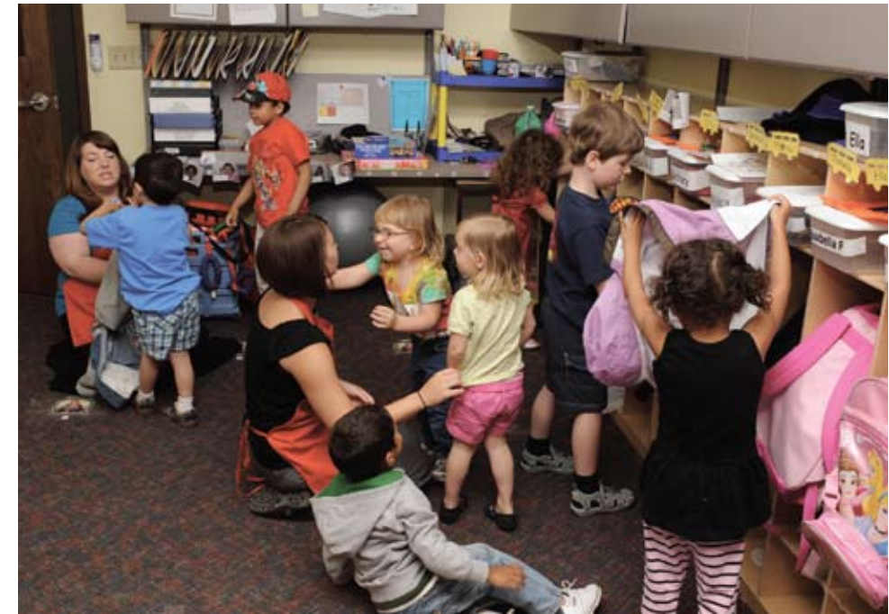
Fredonia students are given the opportunity to provide language and vocabulary development services within a natural environment.

SUNY Fredonia's speech-language pathologists (SLPs) are in demand in a variety of educational, medical, and therapeutic settings. Most graduates accept positions in school districts, hospitals, clinics, rehabilitation centers, medical practice groups, and nursing home settings. Some graduates prefer working with adults or children with a hearing impairment, providing early intervention services to children or services in the new field of corporate speech pathology. Upon completion of a master's degree, graduates complete a Clinical Fellowship Year to meet American Speech-Language Hearing Association (ASHA) certification and New York state licensing requirements.