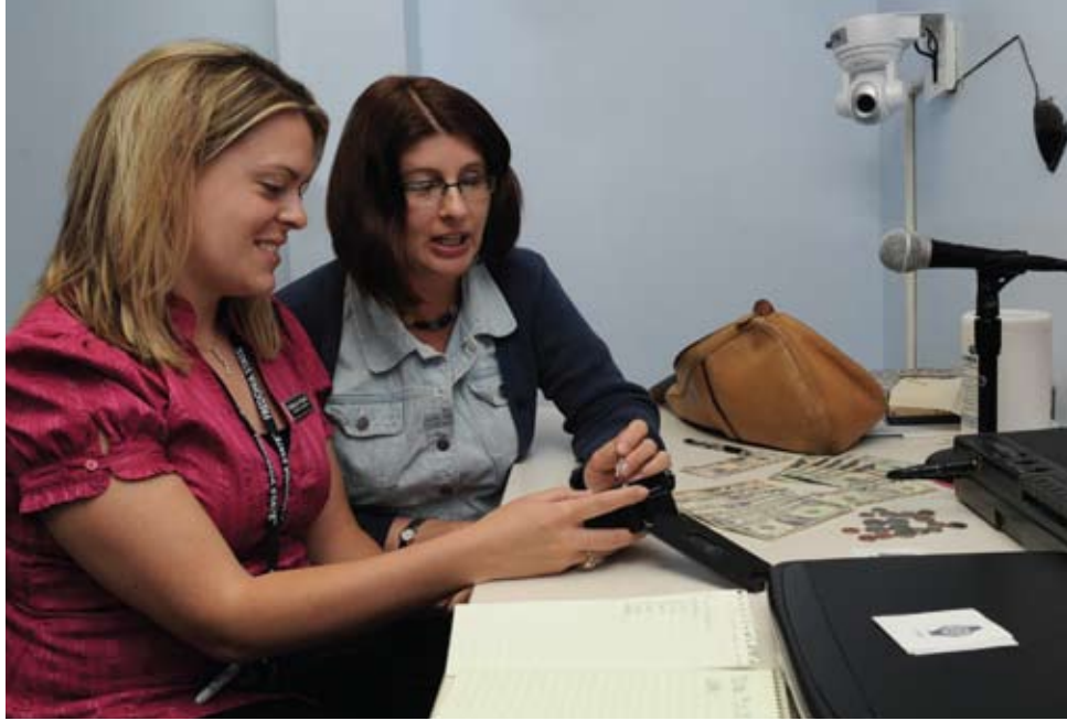
CLINICAL TRAINING (ABOVE) IS SUPERVISED BY SPEECH-LANGUAGE PATHOLOGISTS USING CLOSED CIRCUIT TECHNOLOGY (AT RIGHT).

Nearly every student who earns a bachelor's degree from SUNY Fredonia's competitive program in Communications Disorders and Sciences chooses to pursue a master's degree as well—either at Fredonia or another institution—to achieve their goal of certification and licensure. The department also offers a minor in Communications Disorders and Sciences to undergraduates seeking to enhance other majors. The department seeks to combine professional preparation with a solid grounding in general and liberal education. The graduate program in Speech-Language Pathology is accredited by the Council on Academic Accreditation of the American Speech-Language-Hearing Association.