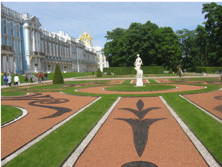
Catherine's Palace outside of St. Petersburg.