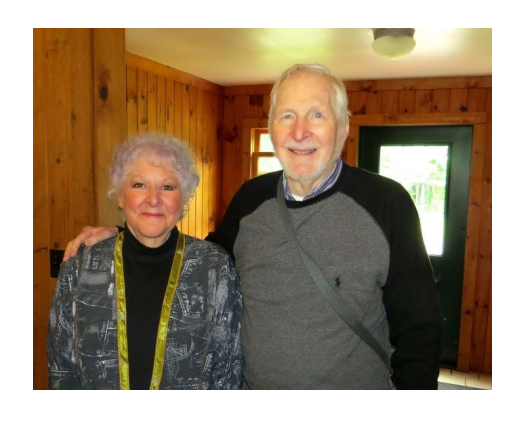
Emeritus members at the summer luncheon held at The College Lodge on June 13, 2019.