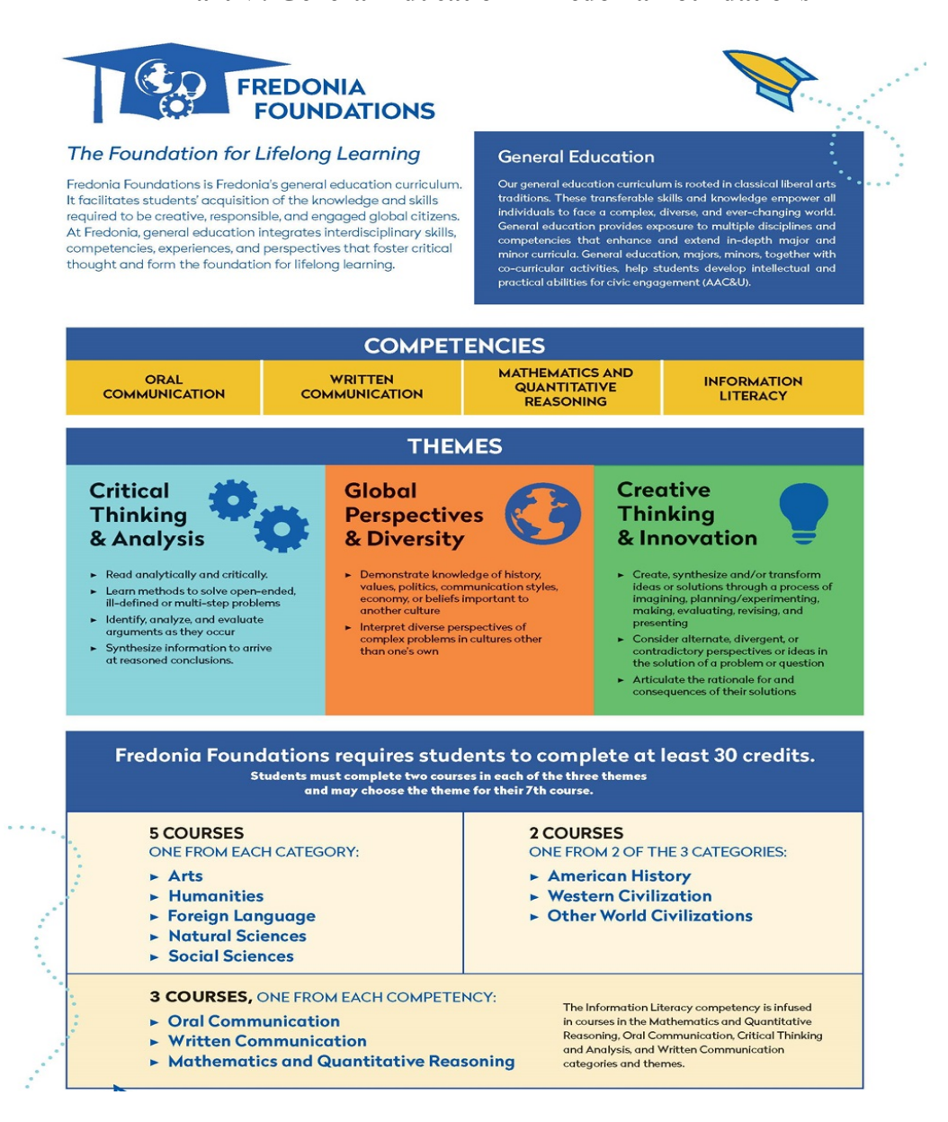
Part V: General Education – Fredonia Foundations