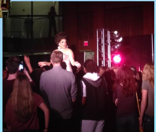
Pride Alliance's bi-annual drag show is always a blast, and it's always extra special when alumni host!