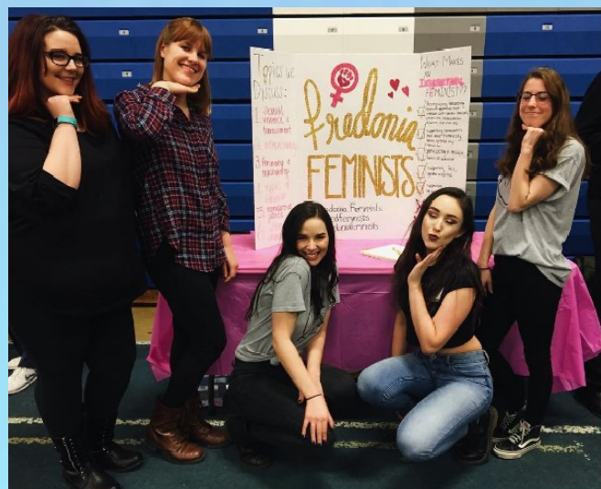
Fredonia Feminists staying fierce as ever.