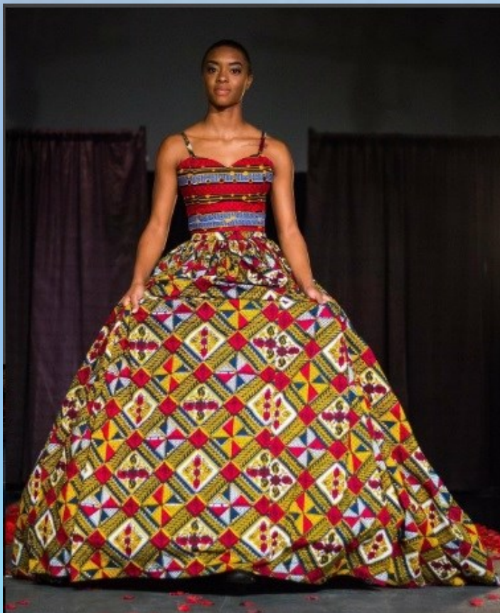
African Wear at the BSU Fashion Show, an annual Multicultural Weekend event.