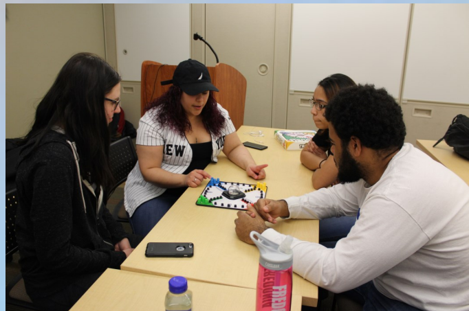
Group activity at a Latinos Unidos general body meeting.