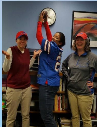
Thanks for all your hard work and dedication, and all the memorable moments in the CMA.