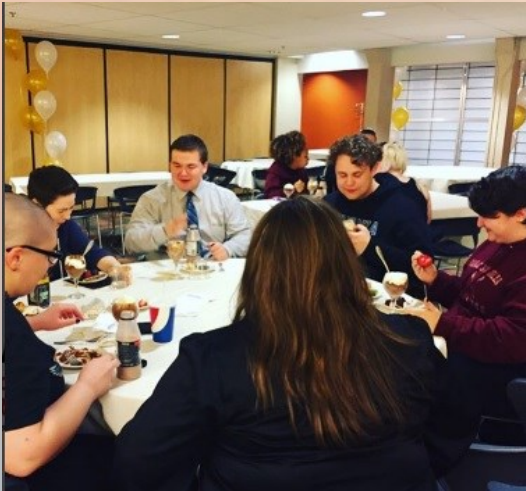
Chocolate Seder/Death by Chocolate was a HUUUUUUGE success, not to mention delicious.