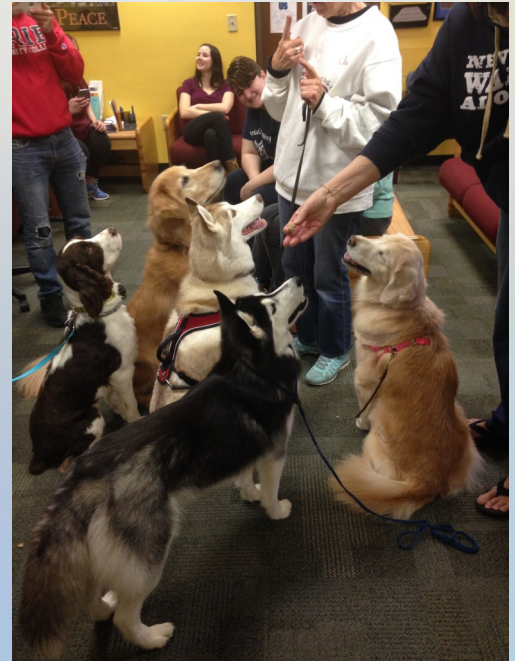
Here in the CMA, one puppy is just not enough. Fortunately, we have lots of love to share!