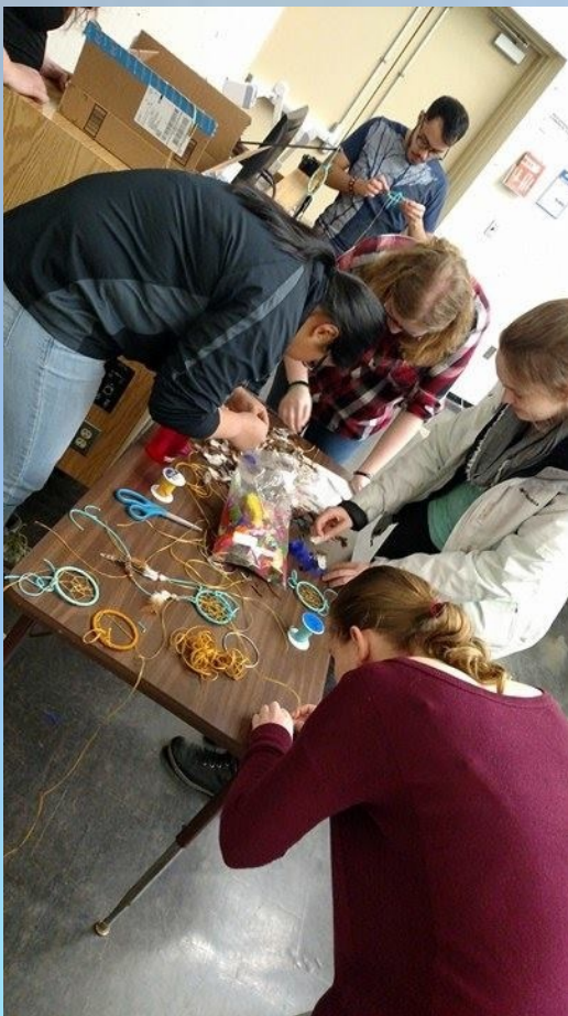
Participants at NASU's annual Dreamcatcher weaving event.