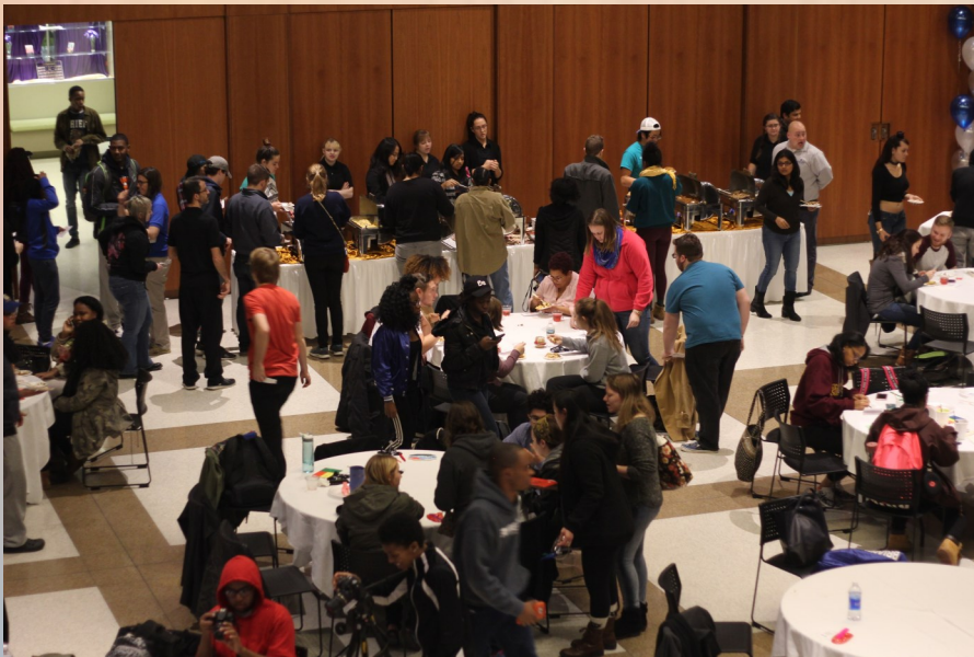
We could not have asked for a better turn out at Culturefest!