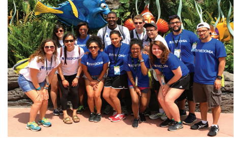
Disney Institute Leadership Workshop, May 2016

are expected to hold progressively more extensive leadership positions on campus. In addition to receiving a $4,000 scholarship, recipients engage in a rigorous and exciting Leadership Development Program while enrolled at Fredonia. Recipients of the scholarship are expected to demonstrate personal leadership and commitment to cultural pluralism and cross cultural dialogue while on campus. Each recipient qualified based on the following criteria: achieved SAT scores of 1100 (or 25 ACT) and maintained at least an overall 85 percent high school average. The scholarships are renewable for up to four years as long as the student maintains the required academic standards and leadership requirements.