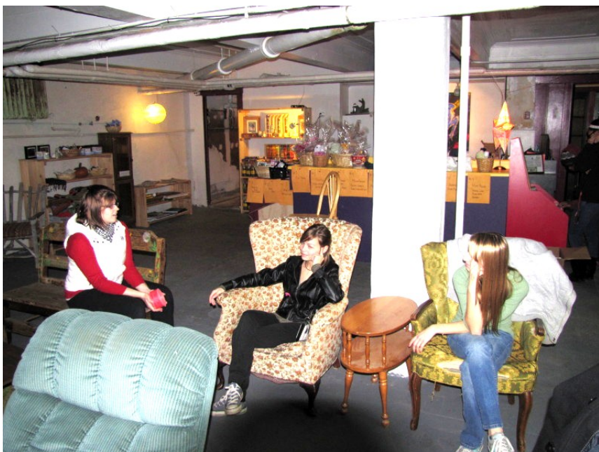
WSU members chillin’ at Wishberry Underground .

Check the next issue of the newsletter for information about scholarship applications.