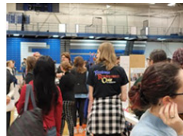
Activities Night, Wednesday, January 29, 2025