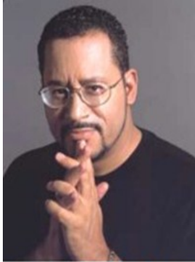
Michael Eric Dyson

This year's Convocation theme is "Raising Cultural Awareness and Building Global Relations," a theme that reflects well the campus commitments to an inclusive, diverse learning community and to global community. The year-long convocation series began on September 26 with the annual Maytum Convocation Lecture, given this year by Dr. Michael Eric Dyson, acclaimed author/sociologist now on the faculty at George Washington University. The title of his keynote address was "The Impact of Culture on Minority Self Image." He also met with several student, faculty, and staff groups throughout the day.