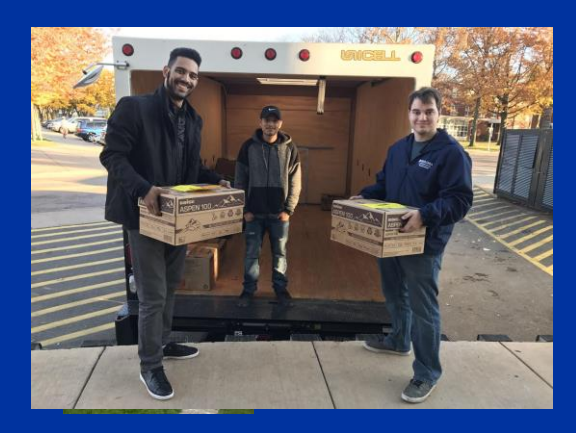
Operation Breakfast Rescue with Kappa Sigma