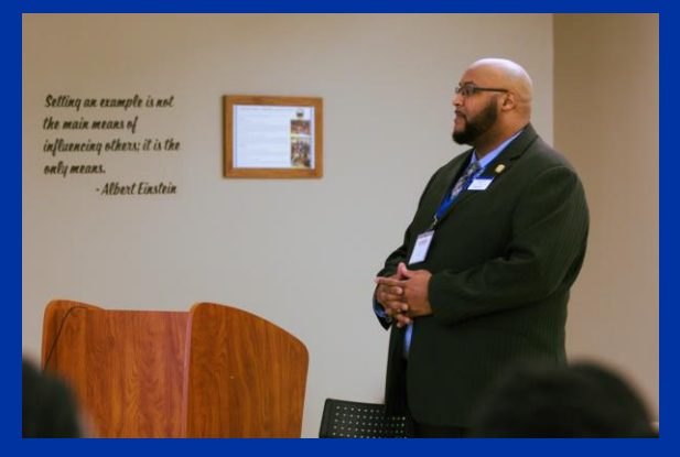
Divine Nine 102 Presentation