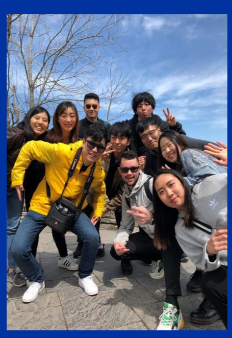
Trip to Niagara Falls State Park

Spring Impact: Approx. 644 attendees involved in 25+ programs and activities.