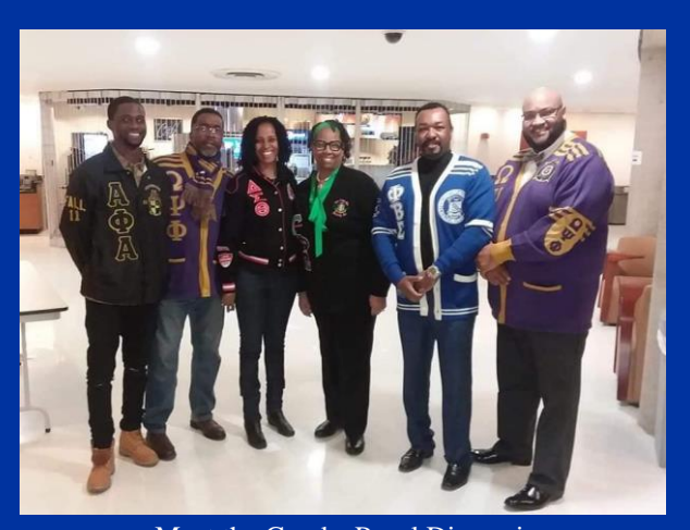
Meet the Greeks Panel Discussion