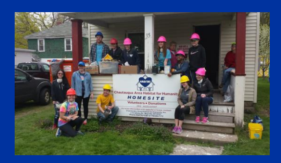
Habitat for Humanity Club Volunteers