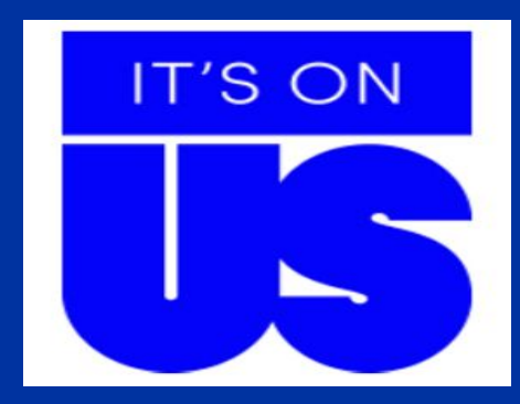
SAVP Services - It's On Us Campaign - Sexaul Assault Prevention