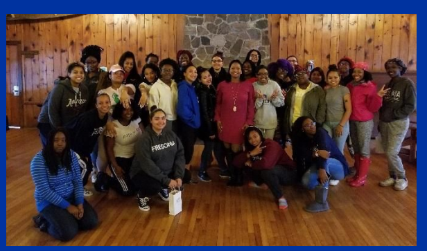
Crowned Rubies Retreat