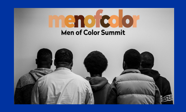
Men of Color Summit