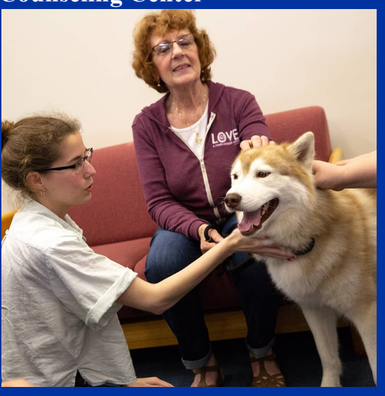
Paws to Relax - DeStress for Success - Counseling Ctr.