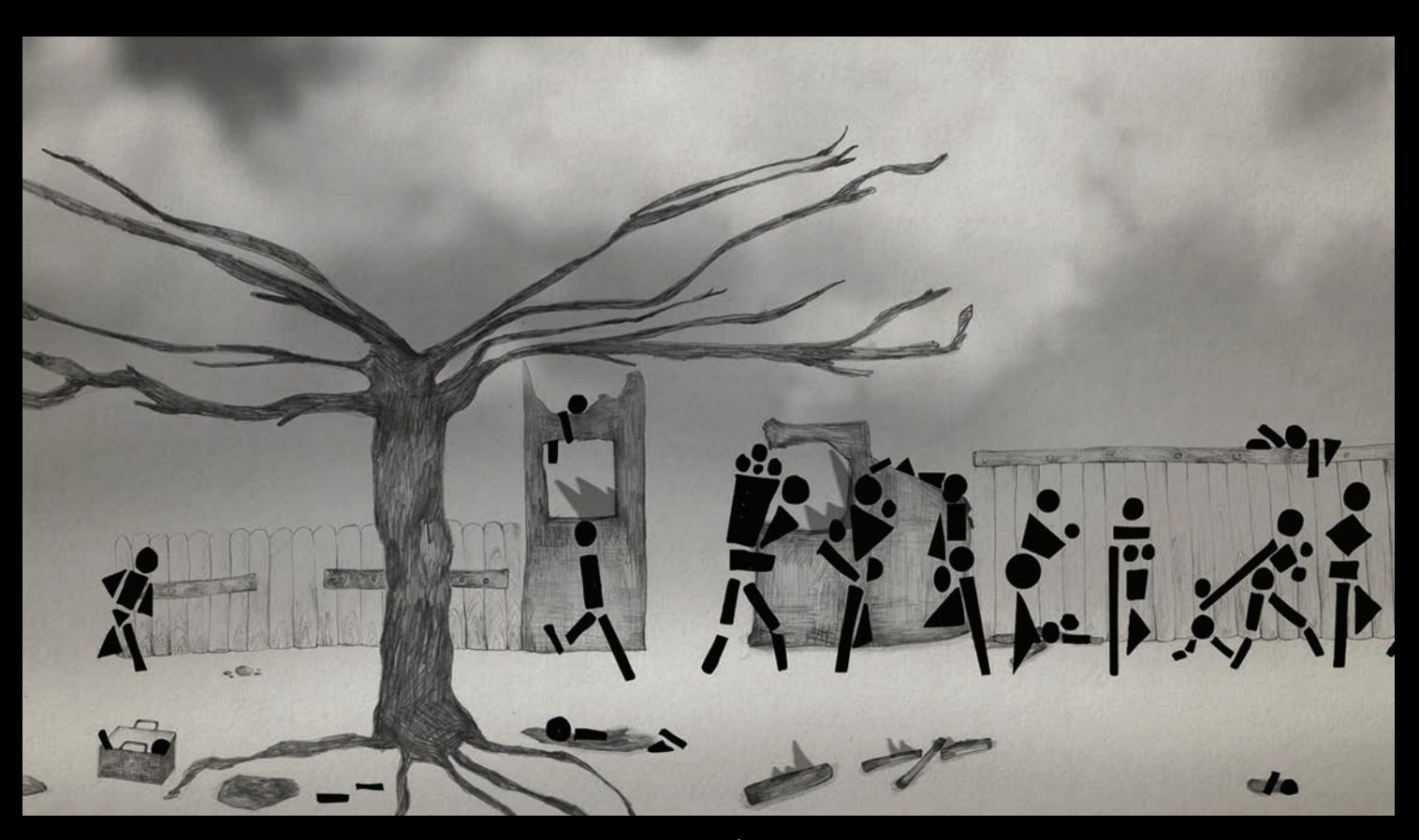
Igor Ćorić, still from Prelazak (Passage), 2019, mixed media animated film