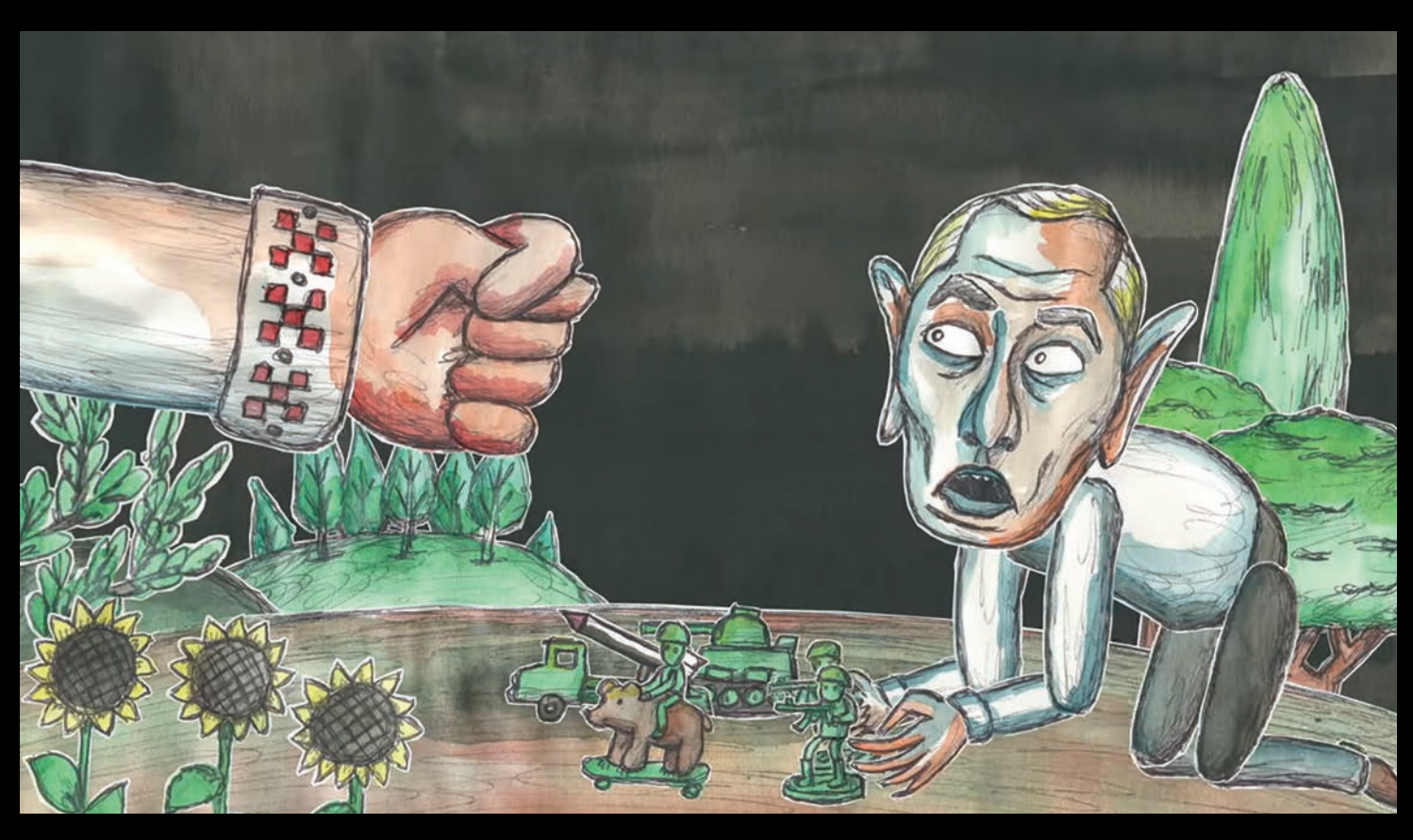
Sashko Danylenko, still from TNMK - The History of Ukraine in 5 Minutes, 2019, cutout stop-motion animated film