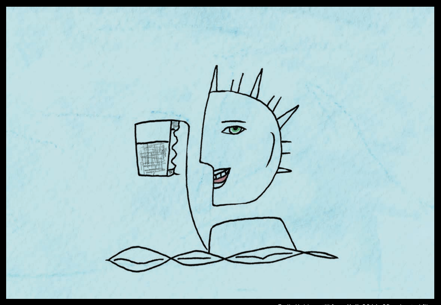
Emily Hubley, still from Hail , 2011, 2D animated film