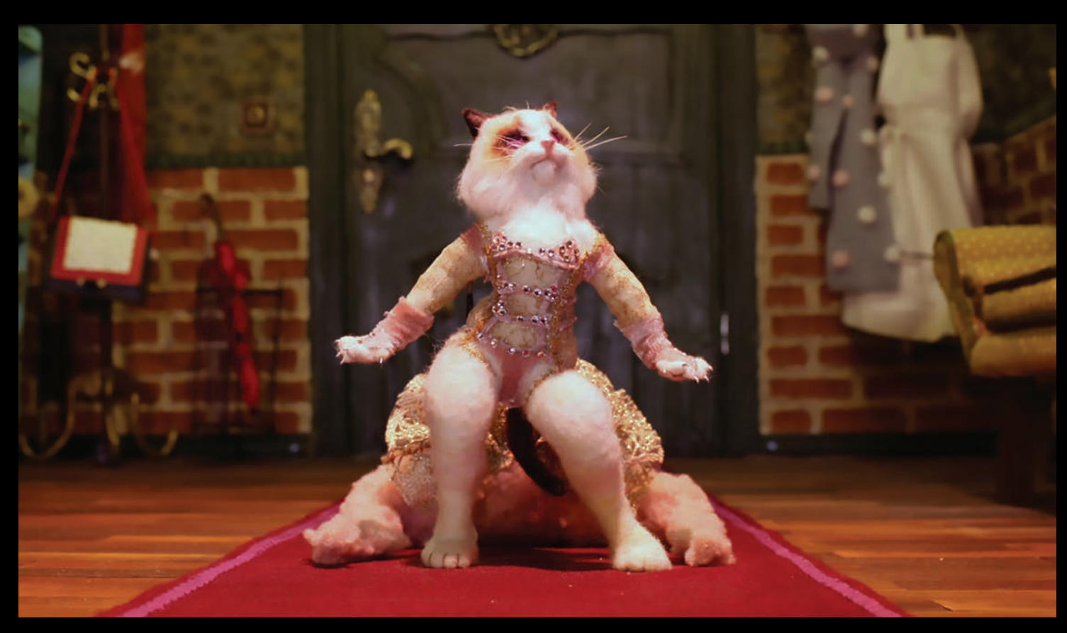
Jie Weng, still from The Quintet of the Sunset , 2019, stop-motion animated film