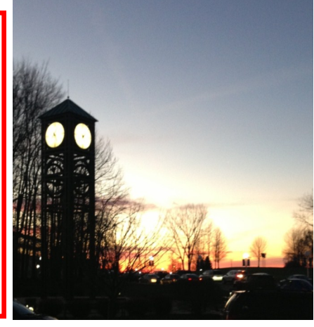
Sunset at Fredonia