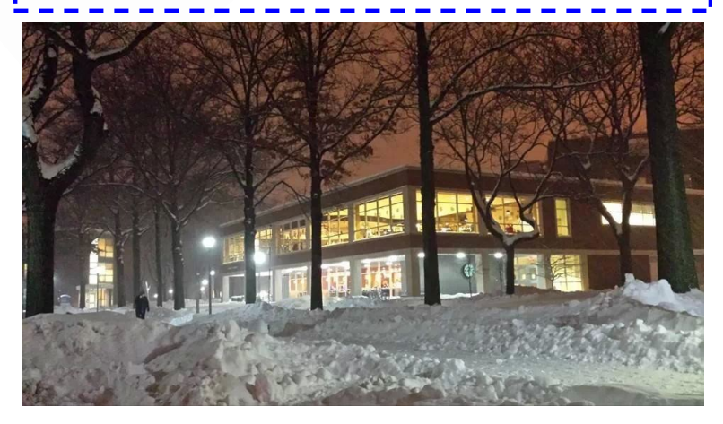
Snowy December night outside Cranston Marche dining hall