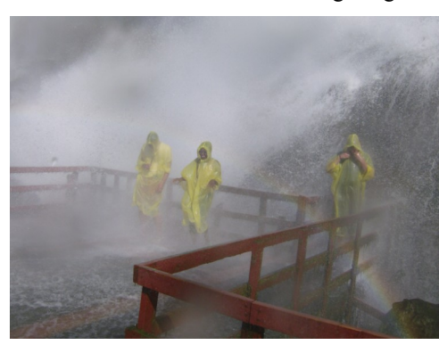
Field trip during EDP's Freshmen August Workshop—Niagara Falls, USA

It is <u>mandatory</u> that new EDP freshmen attend both a SOAP session and the three-day EDP August Workshop.