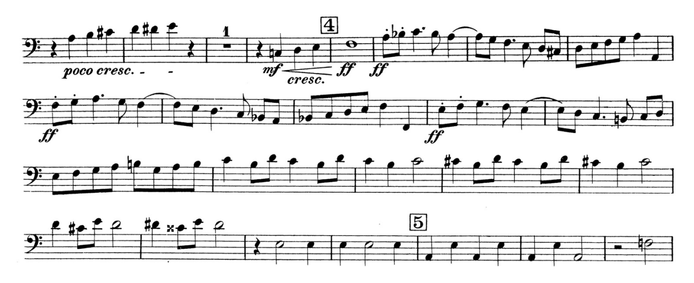
Strauss Ein Heldenleben 3 bars before rehearsal 62 to 2nd bar of 65