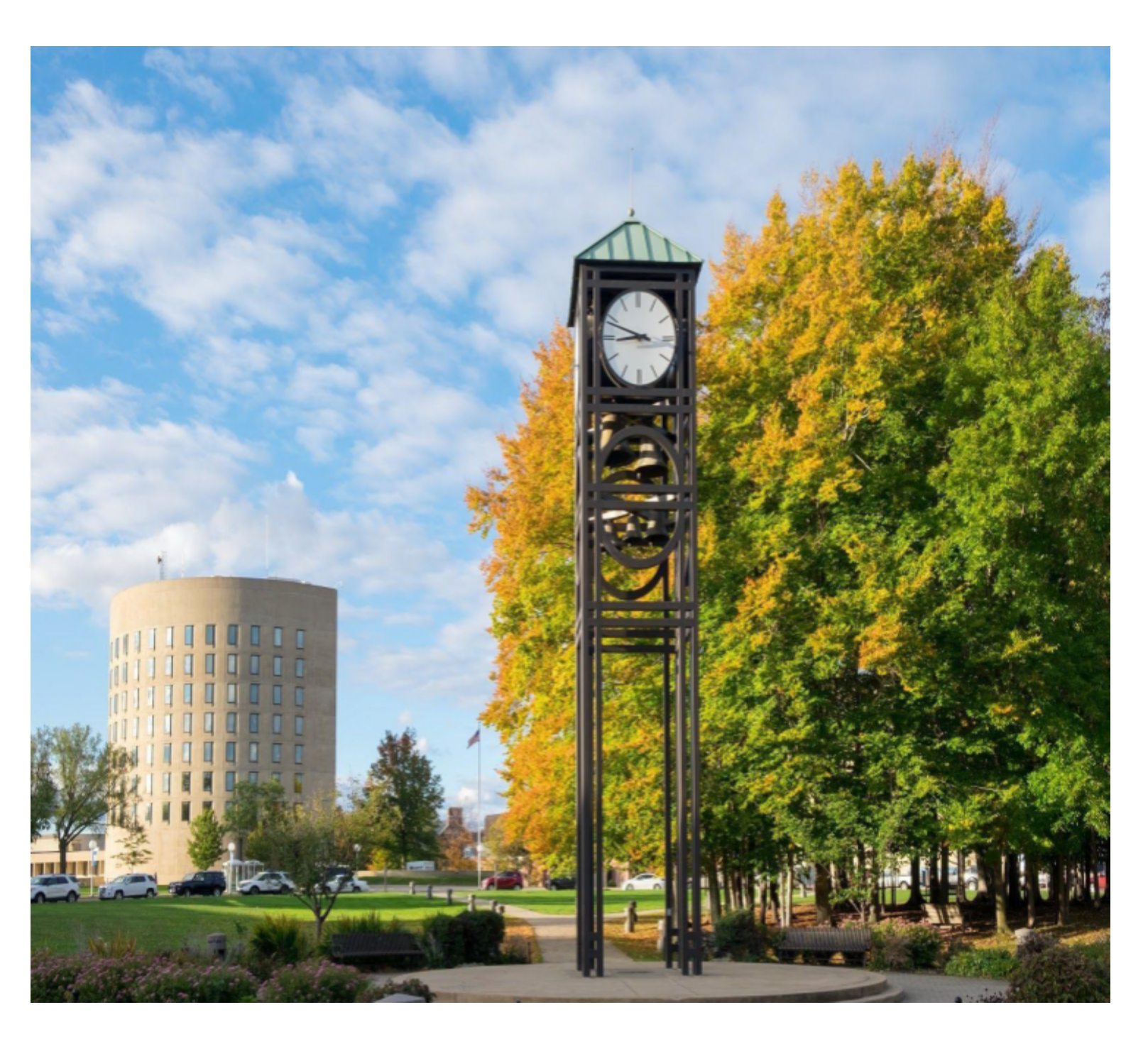
Division of Student Affairs STATE UNIVERSITY OF NEW YORK AT FREDONIA

ANNUAL REPORT Department of Athletics and Recreation 2021 - 2022