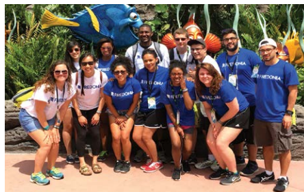
Disney Institute Leadership Workshop, May 2016

For more information on the program and how to apply, please visit the Intercultural Center's website at www.fredonia.edu/Intercultural or give us a call at (716) 673-3398.