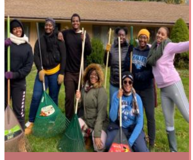
Divine Sound volunteers at Fall Sweep