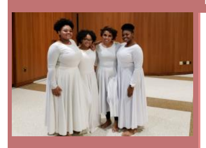
Divine Sound at Fall Concert