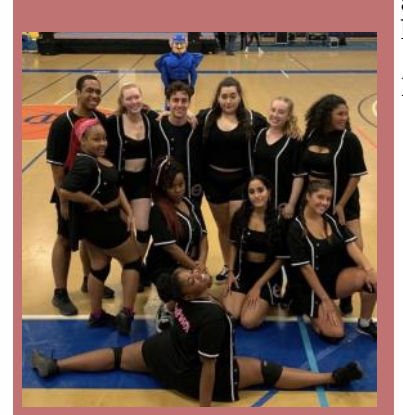
Enfusion Dance Team at Pep Rally